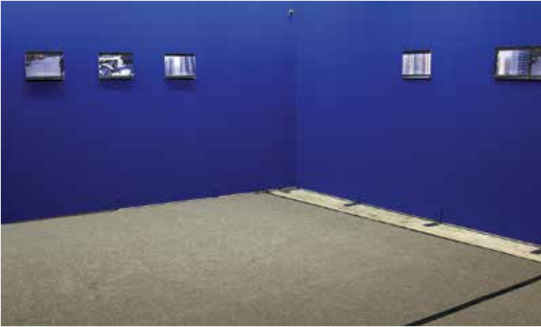
Elva Lai, Freedom Swimmers , 2017, installation view at Landskrona Foto Festival, Landskrona, Sweden.