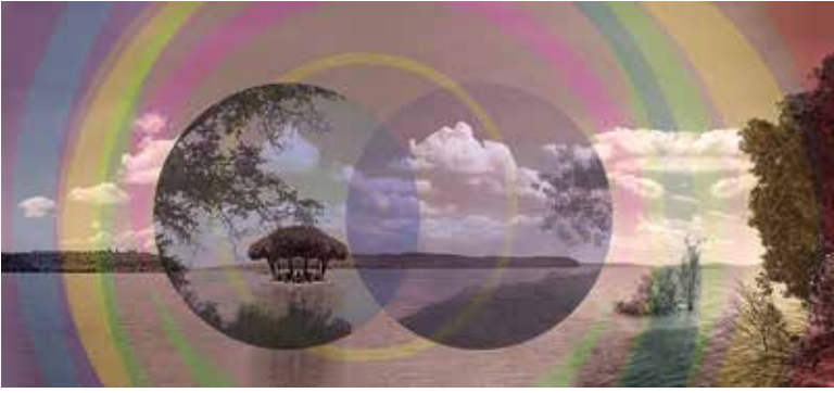
Yvonne Lo, Infinity , 2015, archival print on paper, 92 x 200 cm.